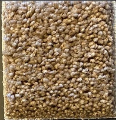
510 HONEY BEIGE